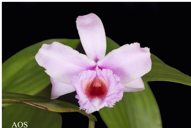
Sobralia decora 'Jaxon' AM/AOS