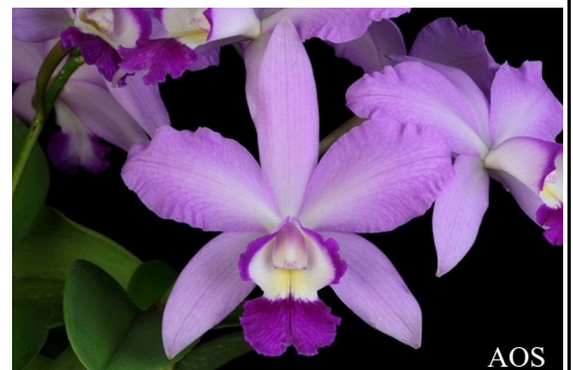
Cattleya Big Dipper 'Mizar' HCC/AOS; Photographer: Ramon de los Santos