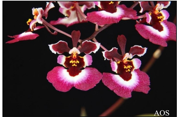
Oncidium Pink Panther 'Elizabeth Grace' AM/AOS