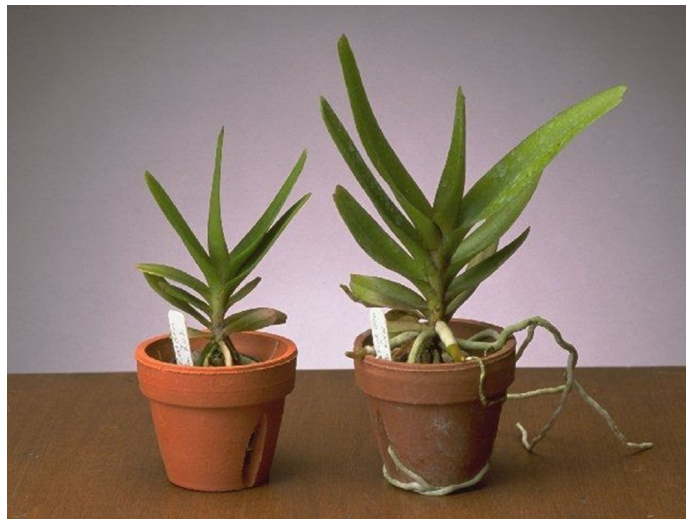
Vandaceous orchids that were under fertilized (left) and received adequate fertilizer (right).

◆ Balanced fertilizers have been traditionally recommended for use with orchids potted in inorganic potting media such as lava rock and Aliflor, and tree fern (which has fallen out of favor due to conservation concerns). Plants mounted on cork bark or other substrates also benefit from using a balanced fertilizer. An example of a balanced fertilizer would be represented by the numbers 20-20-20.