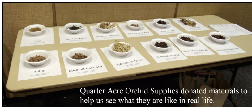
Quarter Acre Orchid Supplies donated materials to help us see what they are like in real life.