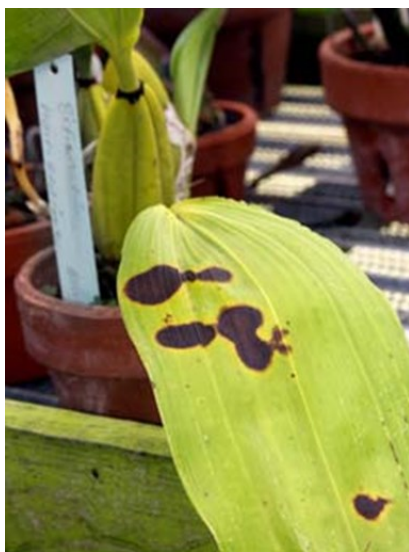
Too much sunlight will burn an orchid's leaves.

and it's used today by Poinsettia growers for the Christmas market. Why is this important to the hobby grower? It's really quite simple. While a street light outside your greenhouse or living