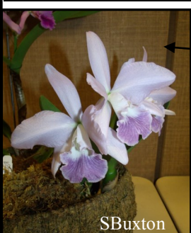
Wake's Cattleyas Christina's Den. Sea Mary "Snow Queen"