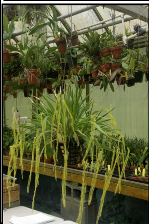
Outside growing area

This is a trial to allow everyone to partake in Show Table Tales.