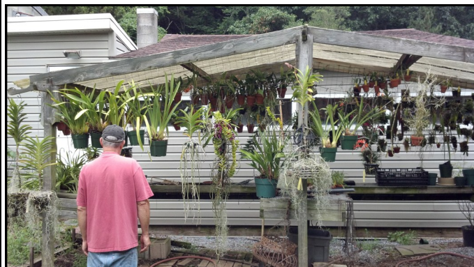
More pictures from Fishing Creek Orchids.

Don't forget we are trying a new meeting schedule to make sure we don't miss anything special!